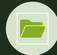
BULK DELETION & SYSTEM JOBS